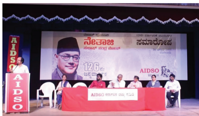
Remembering the legend