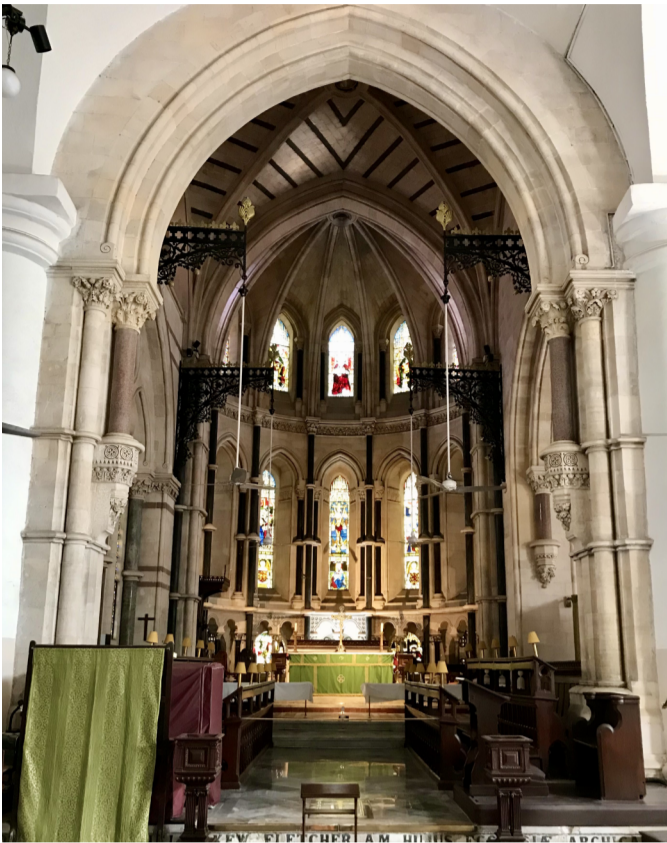
Alter of the 300 year old St. Thomas Cathedral, Mumbai.

Friday, 29 January, 2021 / St Joseph's College (Autonomous) / Vol : 12 ; Issue :02 / www.sjcdeptcomm.wordpress.com