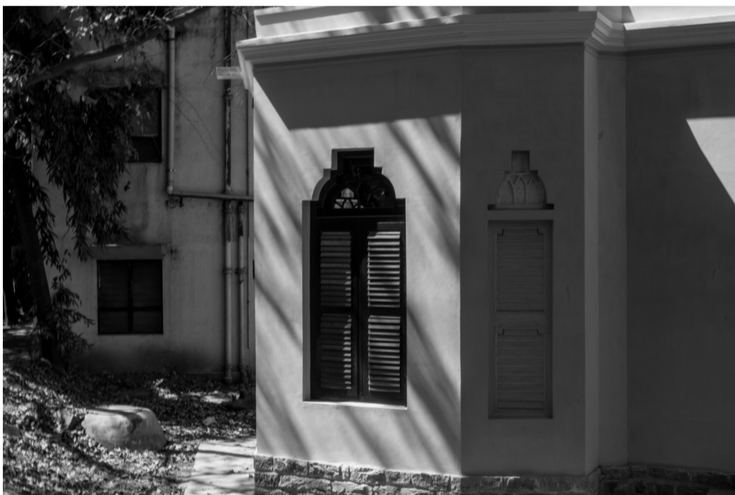
History taken over by urbanisation: Bangalore Gate