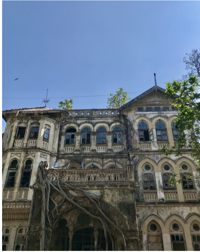
History in ruins- Schoen House, Mumbai