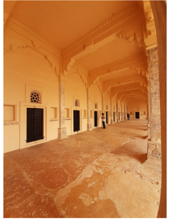
Hallway of ancient Taragarh Haveli in Bundi