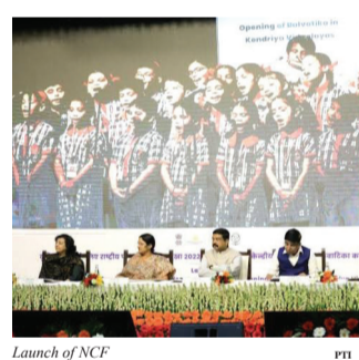
Launch of NCF

"The government may bring toys, and attractive videos to students, but where are the teachers to teach them? 20 lakhs teachers' post is vacant in schools under the central government and as per the scheme of one teacher for every class, the Karnataka government has to fill 2 lakhs teachers' post. When there are no teachers, whatever