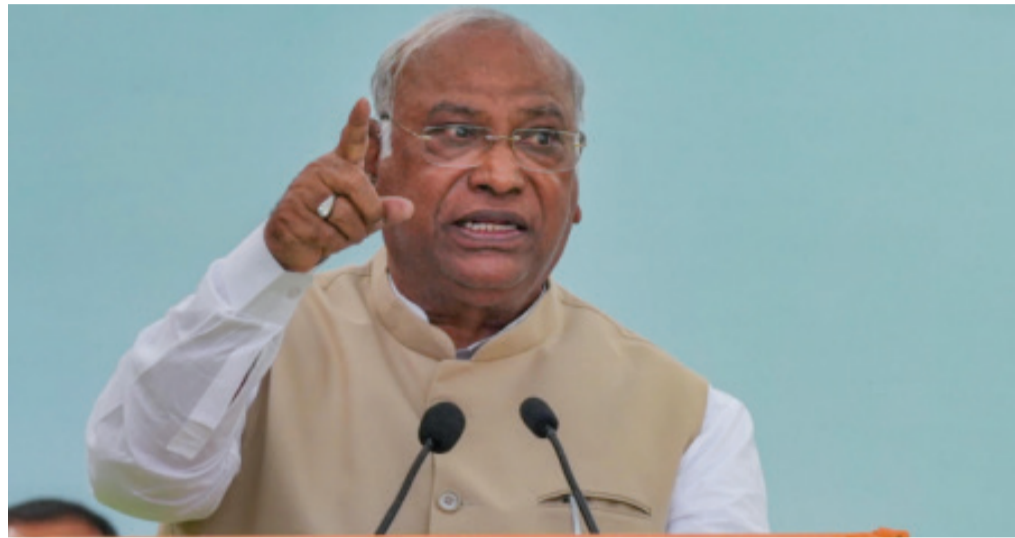
Kharge delivering his first address as the Congress president

Kharge took oath as the 98th president of congress at the All India Congress Committee (AICC) headquarters in Delhi on Wednesday in the presence of Congress Working Committee members, MPs, Pradesh Congress Committee presidents, Congress Legislative Party leaders, former chief ministers,