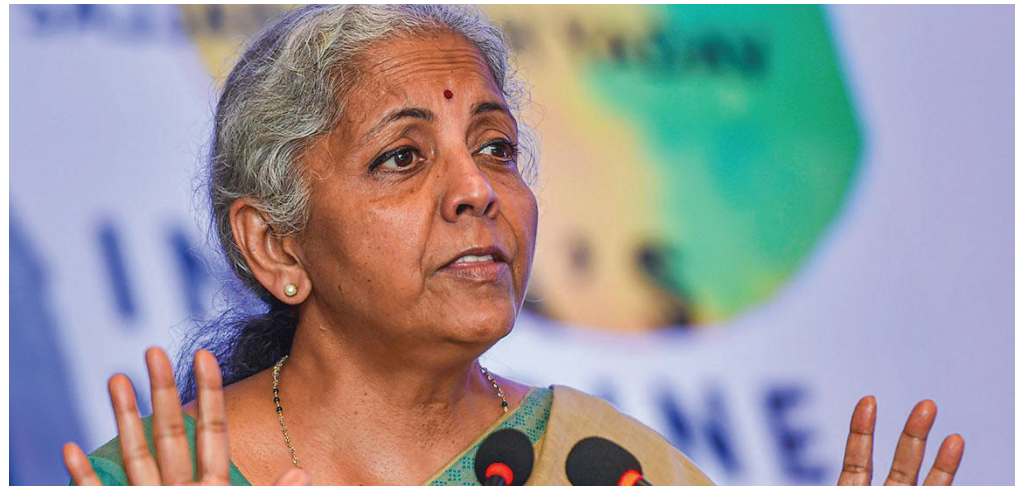
Finance Minister Nirmala Sitharaman

"The first budget of Amrit Kaal is futuristic, growth-oriented and has laid a strong foundation for India at 100 in 2047," tweeted K Sudhakar, Health Minister of the state. "I