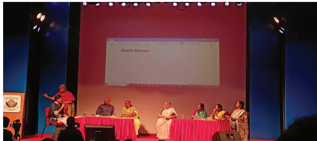
Panel discussion on Politics of Rape