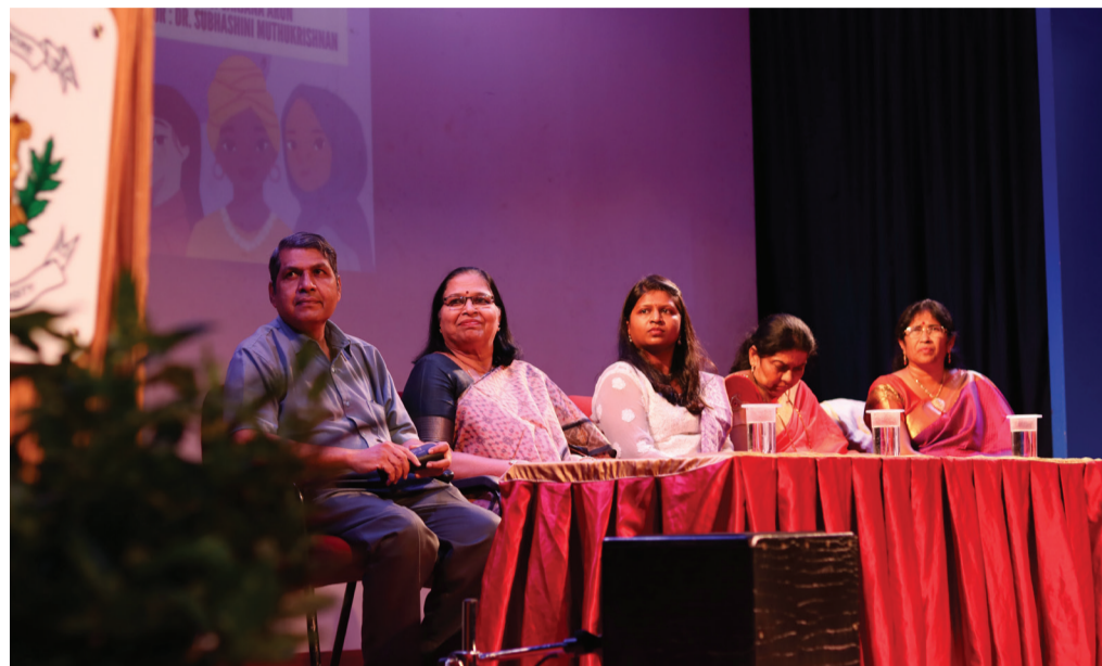
A talk on Women's Day at SJU