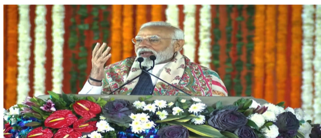
PM Modi addresses from Maulana Azad Stadium Special Arrangement

PM Modi criticised Congress for hindering the territory's development with dynasty politics and a lack of welfare reforms.