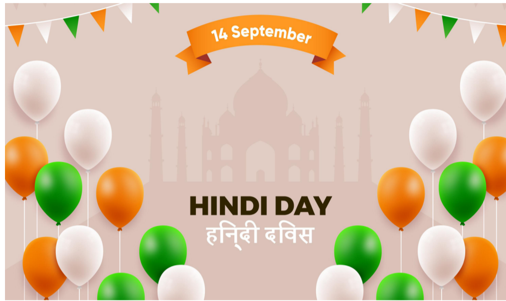
Hindi Diwas Celebration Poster

Ank India, a non-profit organisation in Uttar Pradesh, celebrates Hindi Diwas every year. "We used to conduct many events as part of Hindi Diwas, but now due to the pandemic, Hindi