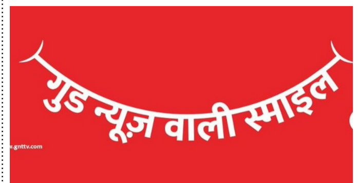
Logo of Good News TV