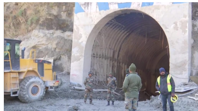
Rescue force on ground

It is estimated that over 30 people are stuck in the Tapovan tunnel. Authorities are racing against time to