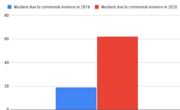
Murders due to communalism in 2019 and 2020

Surprisingly, these murders happened in the year of a